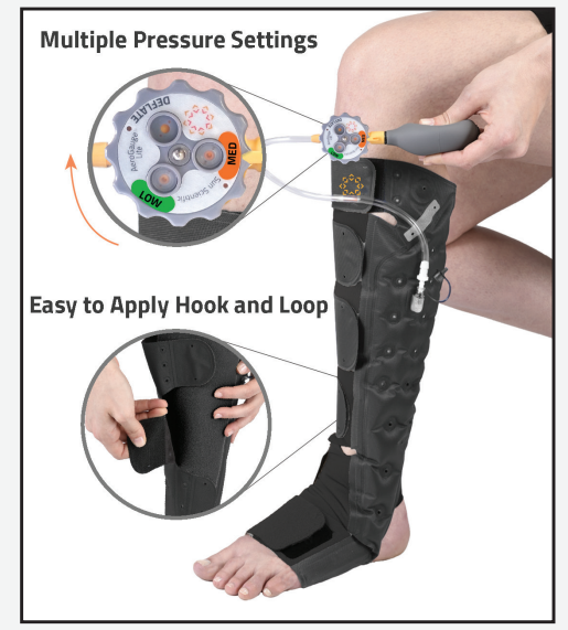
Fig 1. The Aero-Wrap ambulatory pneumatic

compression instantly or reduce the degree at home without the need for wound nurses and (medium grade Class 2-3 compression stocking equivalent) and 40-50 mmHg ((high grade Class 4 deflated easily if there is persistent breathlessness or chest discomfort. No rushing ambulances are necessary.